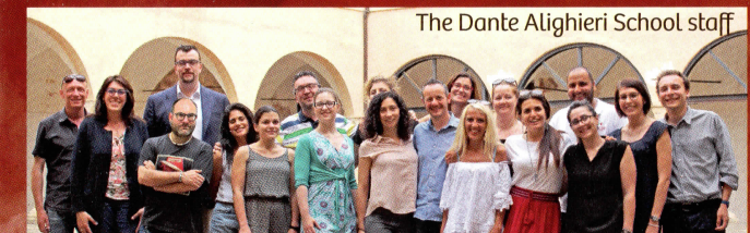
The Dante Alighieri School staff

Choose the quality and the experience of the Dante Alighieri School